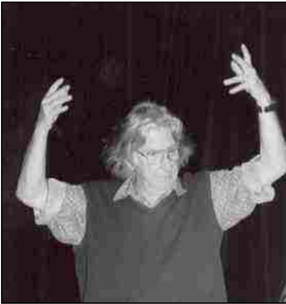
Dr. Augusto Boal

Boal 3-Day Workshop, May 28-30 2007, 1:00-6:00PM, Studio A (Rarig 506)